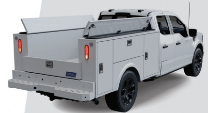
Depicted is the TOP PAK setup.

STAHLL TRUCK BODIES are engineered with an innovative lock-bolt fastener design to provide unbeatable durability and eliminate rust issues from traditional welding and grinding. Floor understructures are rigidly welded for structural integrity with mounting points reinforced by U-channel gussets.