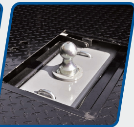
Ready to Connect

FOR MORE INFORMATION: STAHLTRUCKBODIES.COM