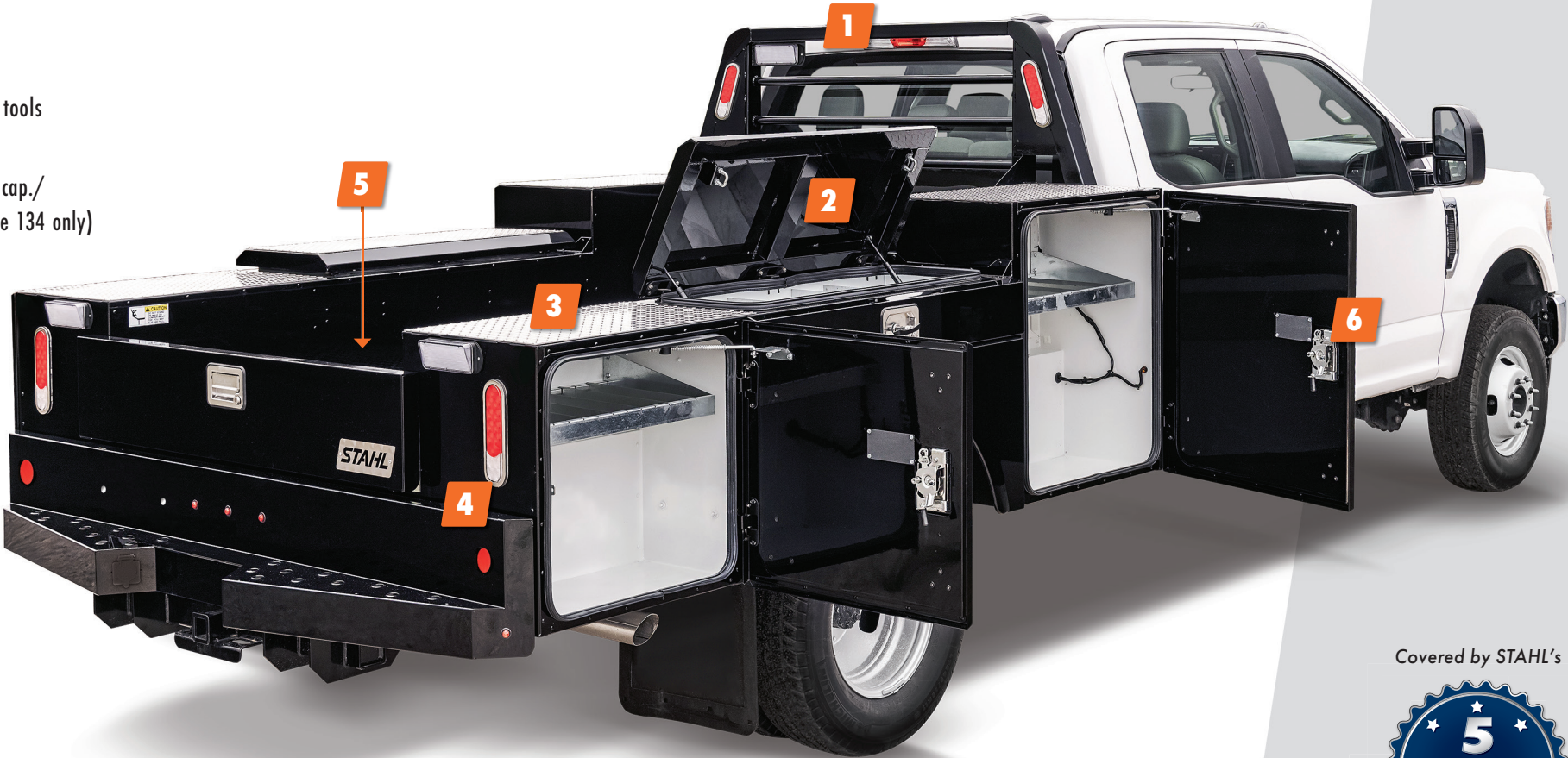
Elite body is painted with a durable black acrylic urethane. Compartment interiors are white to enhance visibility in low light.

The Challenger Elite is engineered to use the chassis OEM's mounting points – eliminating the need for frame drilling and shear plating – making it faster and easier to mount.