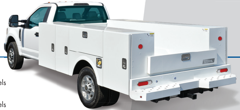
Body pictured with optional Recessed Punched Bumper with surface-mounted LED 3-in-1 Light Kit and Aluminum Fuel Fill